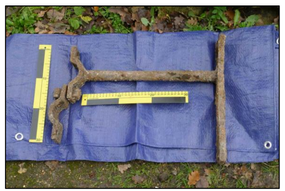
Photo 10- Iron pipe support, found at the south-eastern end of the East Flue. The central rod is 16'' long, and the clamp on the left could accommodate a 2'' diameter pipe when fully closed. (30 cm scales)