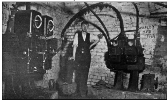
Photo 24 – Underground worker in an electrical switch room at Parkfield. (caption based on the work of D P Lindegaard)

Website: www.aibt.org email: info@aibt.org