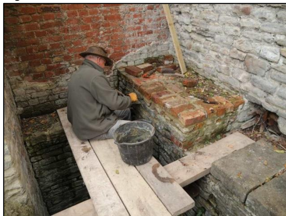
Photo 5-Missing\; bricks have been replaced on the platform in the western corner of the Vertical Engine House.