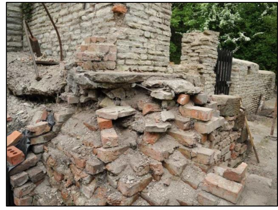
Photo 6- The brickwork at the end of the East Flue and the steps outside the entrance to the Vertical Engine House in May 2018.