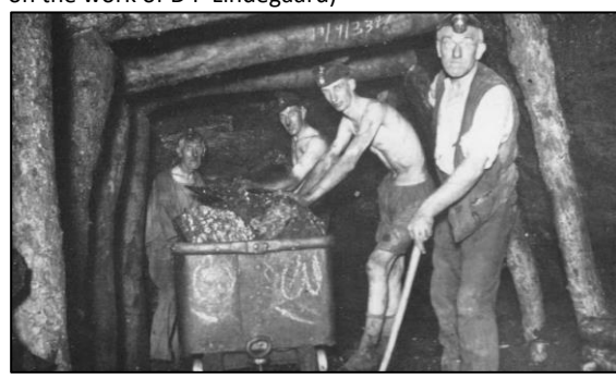
Photo 23 – Miners with a tub loaded with coal underground. DPL thinks the writing on the timber above their heads could be interpreted as 13 Sep 1933, which would date when the photograph was taken. (Photo from the K Gardner collection and caption based on the work of D P Lindegaard)