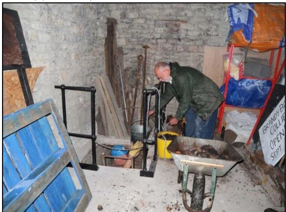
Photo 27 – Spoil being removed from the under croft of the Horizontal Engine House.