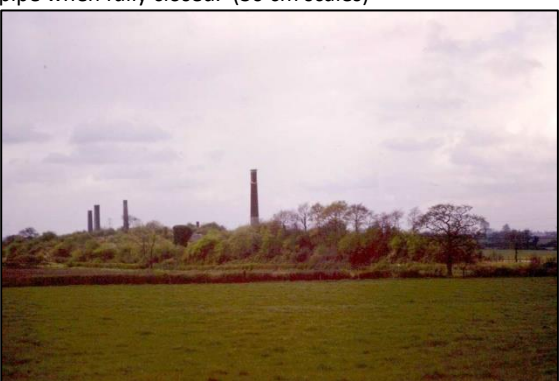
Photo 11 – The Brandy Bottom chimney can be seen in the centre of the photo, with those of the Shortwood brickworks are on the left.