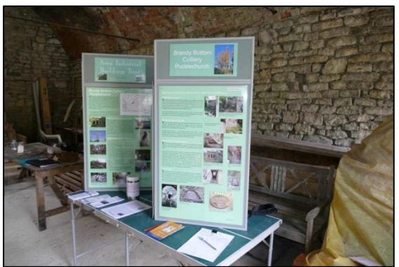
Photo 20 – The display boards were placed in the Horizontal Engine House on the Heritage Open Days weekend, with some of the artefacts found over the years on the table in the left background.