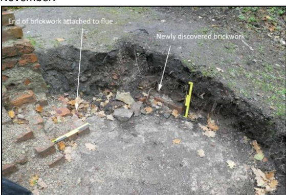
Photo 9 – View of the excavated area at the end of the East Flue. The left hand arrow marks the end of the brickwork attached to the flue, while the right hand one shows the start of the newly discovered brickwork. There are signs that the bricks were originally laid across the gap. The flat surface in the foreground is the base of the flue. (30 cm scales)