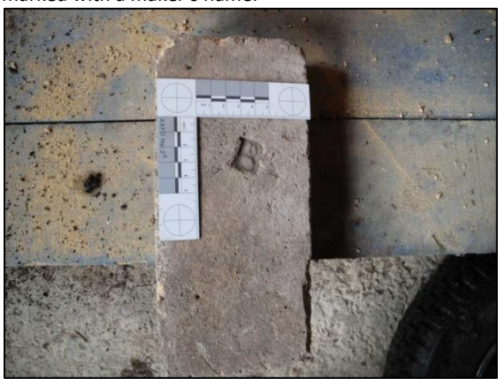
Photo 33 – Tapered arch firebrick, found in the under croft of the Horizontal Engine House, with the maker's mark 'B' stamped onto one face.