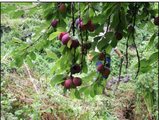
Photo 35 – A fine crop of plums growing beside the pond, which were harvested and eaten over lunchtime at a work party. The tree would have been planted in the garden of one of the now-abandoned cottages.