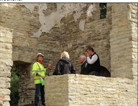
Photo 18 – A tour party in the Cornish Engine House during the Heritage Open Days weekend.