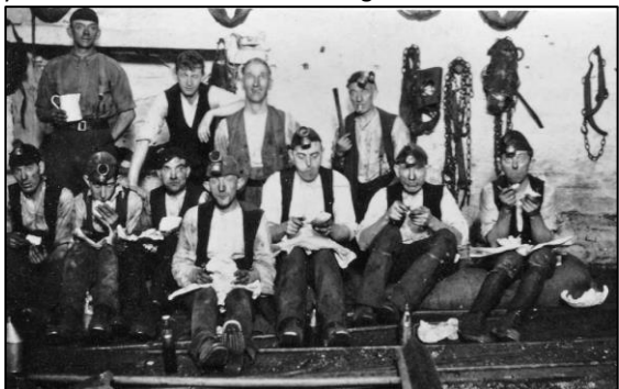
Photo 21 – A group of miners having a lunch break, called bread time, in the stables at Parkfield. (Photo from the K Gardner collection and caption based on the work of D P Lindegaard)