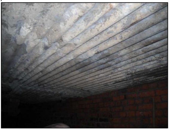
Photo 30 – The underside of the false floor of the Horizontal Engine House, taken at the south-western end of the central bay of the under croft.