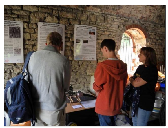
Photo 19 – Visitors on the Heritage Open Days weekend looking at H Orr-Ewing's 1:50 scale model of the New Pit heapstead. (See photo on top of page 3) The three 'Local Industrial Heritage' display panels can be seen on the wall behind the visitors.