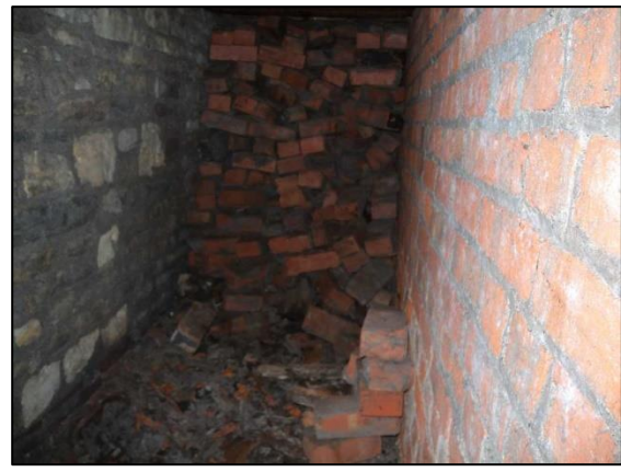
Photo 29 – Bricks stacked up on the north-west side of the under croft. Judging by the view from the other end of the under croft, they appear to be stacked against a pillar.