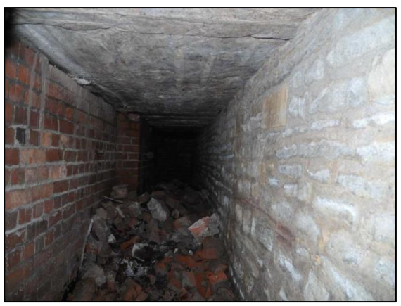
Photo 28 – View along the south-eastern side of the under croft, showing the pile of bricks that will have to be removed.