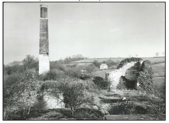
Photo 15 – The chimney, Old Pit heapstead and Cornish Engine House, taken from a spot on the New Pit heapstead. Close examination of the original shows that the masonry at the top of the chimney was just starting to deteriorate.