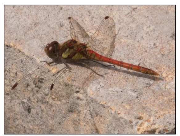
Photo 34 – Common Darter dragonfly outside the Horizontal Engine House.