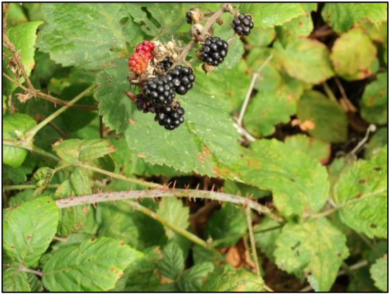
Photo 36 – Brambles ripening on the Heritage Open Days weekend. Many visitors were seen plucking brambles from the bushes during the weekend.