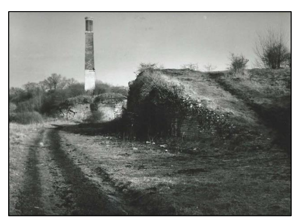
Photo 13 – View looking north-eastwards from the bottom of the New Pit heapstead ramp.