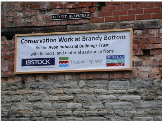
Photo 26 – One of the sponsors' banners has been fixed permanently to the Old Pit heapstead, so that it can be seen by passers-by at all times.