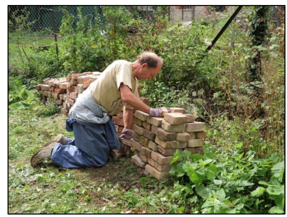
Photo 16 – The work of tidying up the enclosures before the Heritage Open Days has brought one volunteer to his knees.