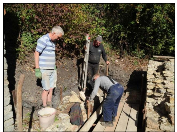
Photo 1 – Working on the scaffolding across the top of the winding drum pit, Vertical Engine House.