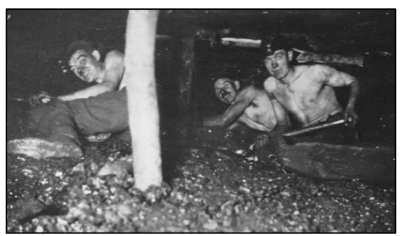
Photo 22 – Working underground in a narrow seam at Parkfield. These would have been 2 ft or 2 ft 6 in thick. (caption based on the work of D P Lindegaard)