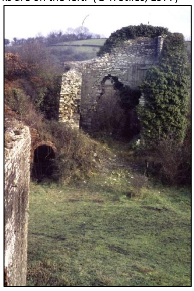
Photo 12 – The Cornish Engine House from the top of the New Pit heapstead.