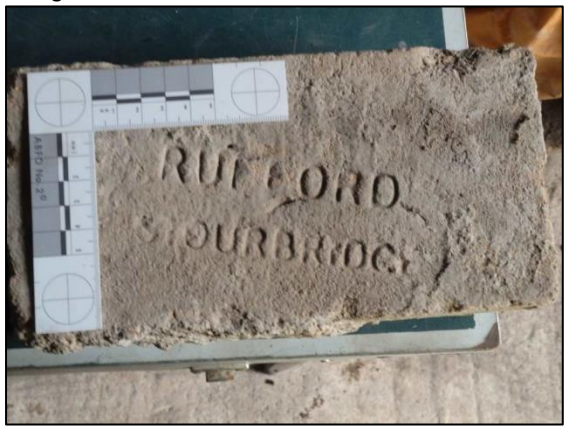
Photo 32 – Tapered firebrick, found in the under croft of the Horizontal Engine House, with the maker's mark 'Rufford Stourbridge' stamped onto one face. A similarly marked brick was found in the Vertical Engine House in 2016. The other tapered firebricks found, with the exception of the one seen below, have not been marked with a maker's name.